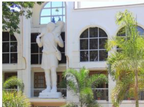
Good Shepherd Chapel