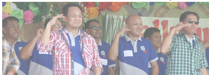
Members of the host Batch 90 showcase their dance

"This event gives me reason to come back often to USL. I never thought it feels so good to come home and be with my Louisian