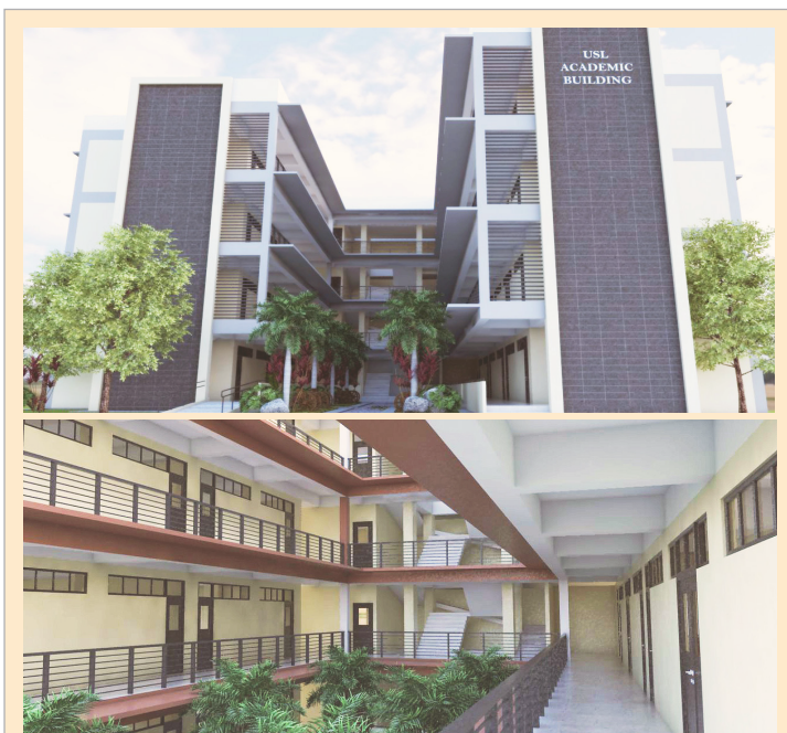
SHS Building. Currently under construction, the four-storey academic building for the Senior High School will house 18 classrooms, 3 laboratories, offices, a faculty room, and comfort rooms. The building's contemporary style highlights the atrium that allows a visual link to the environment; state-of-the-art facilities and modernized amenities.

“I also want to prove you don't need money to explore the world. You need to collaborate. Hopefully through networking, utilizing public libraries, and of course the internet, I will be able to fulfill this project. It serves as a personal research project about English and education around the globe.”