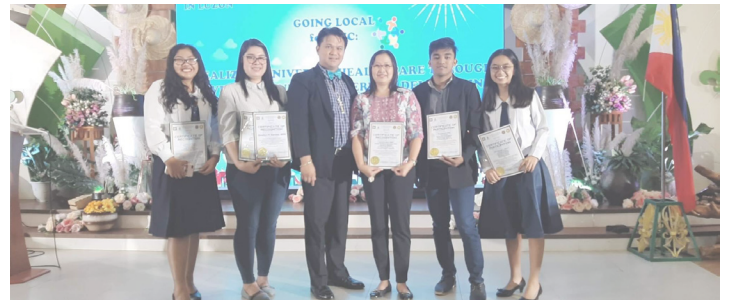
USL researchers with one of the organizers of the forum

SHAS faculty, ranked third for her presentation “The Application of Nursing Leadership on Patient Safety Culture.”