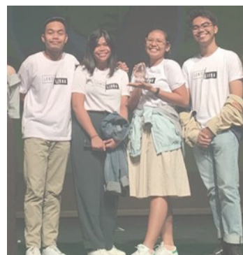
USL-SHS representation at the 3 rd MSFF

Set in USL, the story is about a group of Senior High students that finds frustration