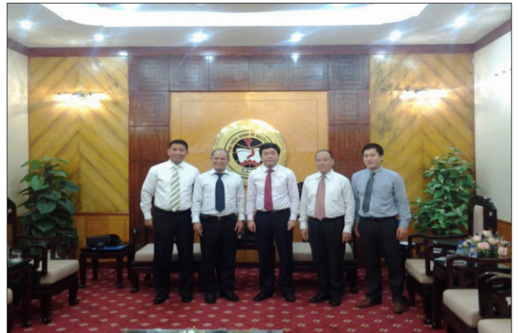
The two USL officials with Vietnam's National Economics University officials