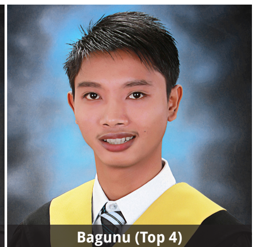
Bagunu (Top 4)