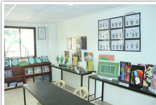
Center for Innovation and Leadership in Accountancy and Business (CILAB)