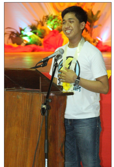
A thanksgiving Mass, motorcade, and dinner were held in honor of the USL topnotchers and passers.